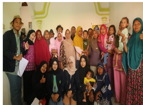
Figure 2. Stunting socialization

This socialization activity is very effective given environmental problems that are still indifferent to cleanliness, especially regarding waste, people who lack knowledge about nutrition, and the habit of defecation, which is continued and lack of awareness of the dangers that defecation will cause, such as polluted water sources, easy infection. Disease malnutrition in children so that they can experience symptoms of stunting, and there are still many impacts that this behavior can cause. The weakness of this activity lies in the enthusiasm of the participants. The participants' enthusiasm can only be triggered by the symbolic provision of healthy food and other consumption. This condition occurs because they are willing to give their time and leave their jobs temporarily to participate in this socialization activity.