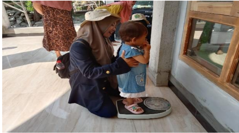
Figure 1. Body Weight Registration