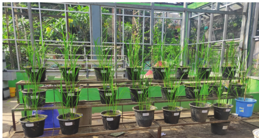
Figure 2. Biochar and biological fertilizer for rice's treatments.