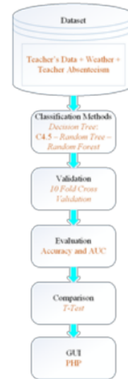
Fig.3. Research framework.

The method used is the classification of Data Mining. As a classifier selected 3 decision tree algorithms, namely: C4.5, Random Tree, and Random Forest. At the evaluation stage a number of classification metrics will be used. The best performing algorithms will be selected for their use as a basis for GUI creation.